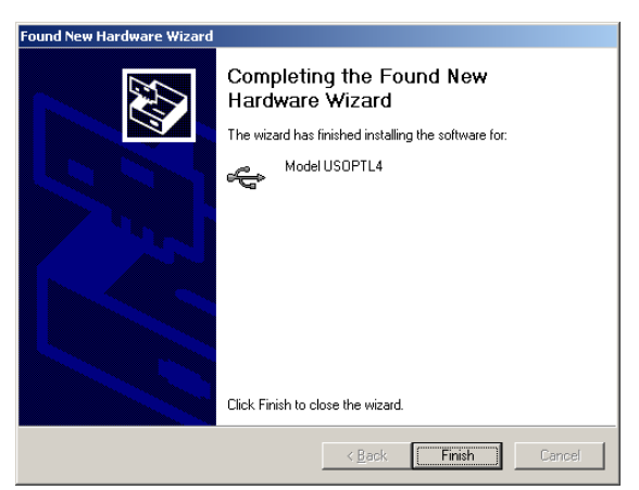
#3. The screen above will appear. Click the Finish button to complete the installation.

#2. The screen above appears. Make sure Install the software automatically is selected. Then select the Next> button.