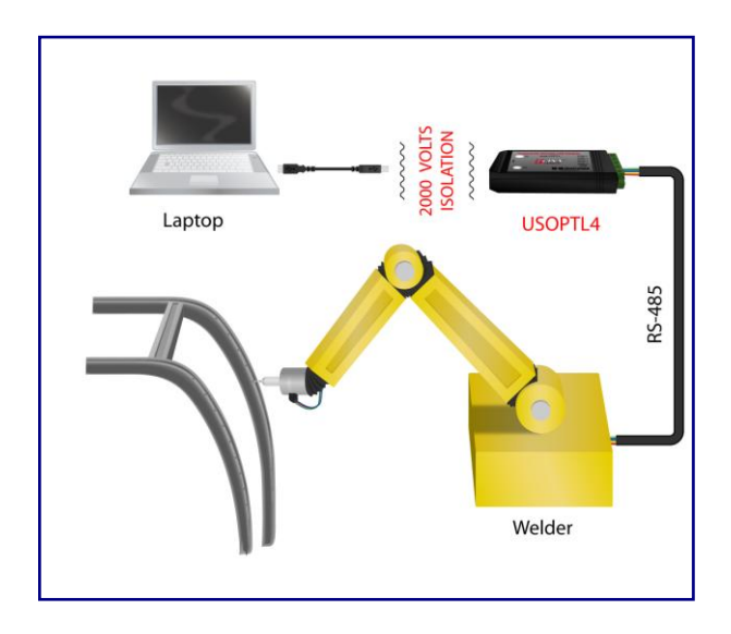
Connects PCs or laptops with USB ports to devices with RS-232, RS-422, or RS-485 ports.

Models USOPTL4 and USPTL4 are USB to one port RS-422/485 converters. Supporting 2-wire RS-485 or a 4-wire RS-422/485 communications, these devices are great for any application that requires long range or multi-drop capabilities. Both models use pluggable terminal blocks on the RS-422/485 side and have a pair of LEDs that indicate data being transmitted or received. Model USOPTL4 includes special circuitry that adds 2000 volts isolation protection against ground loops and voltage spikes. Both products draw power from the USB port so no power supply is required.