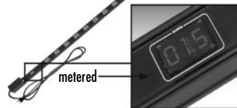
PDT Series with local amp meter