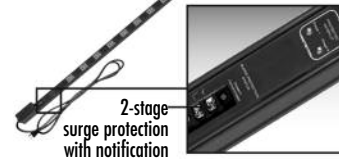
PDT Series with surge/spike protection