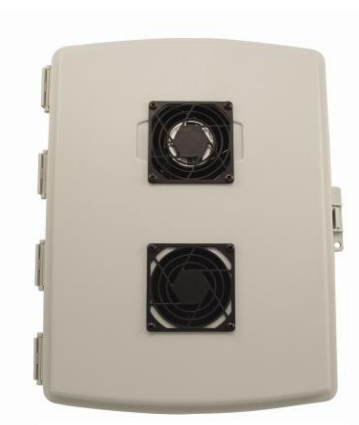
Vented Lid & Fan