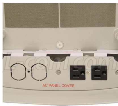
120VAC Power Panel