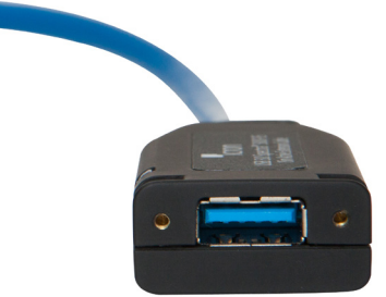
Locking USB Receptacle