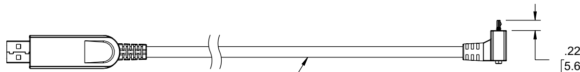
USB 3.0 HIGH FLEX CABLE JACKET: PVC, BLACK NOM DIA.: .217" [5.5]